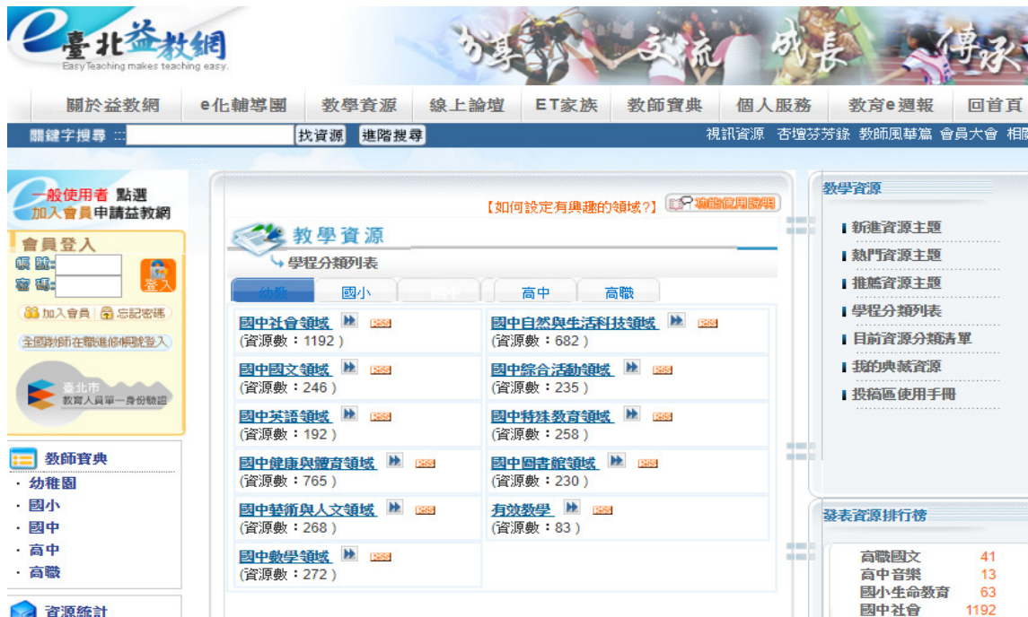
Figure 2. The screenshot of the educational portal (ET Web)

distributed and a total of 317 responses (83.0%) were received. Due to missing data and outliers, this study obtained an